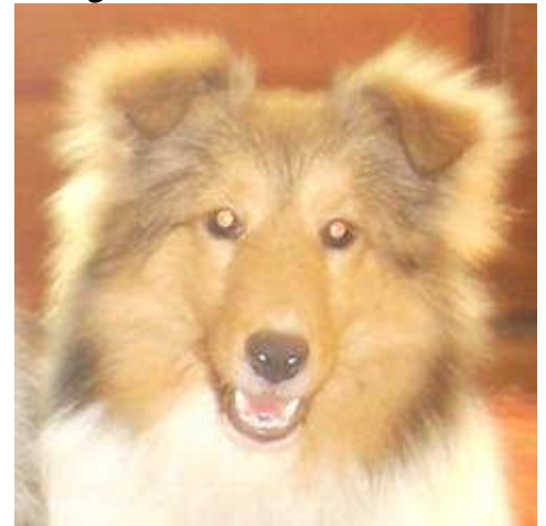
Ella, a nine month old Sheltie, pictured above, died after suffocating on a bad liner from a box of Cheez-Its snack crackers.