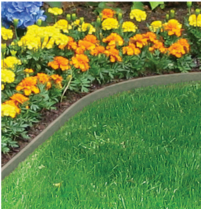
This is a composite material that has a wide, rounded top edge that is pet-safe because there are no hard, sharp edges to cut your dog's feet.

During our home visits with perspective adopters, one of the things we look at in the yard is if there is lawn edging present. If it is present in the yard, is it pet-safe? How do you know? There are a couple types that are safe and one that is particularly unsafe. The pet-safe varieties are made of a composite or hard plastic and are usually colored brown or green to blend in with the landscaping and are usually fairly wide and rounded on the top edge. But there is a metal type that is fairly safe for your pets. It is the kind that is 'folded' on top which provides a rounded edge on the exposed top surface. The main thing that you have to watch for, even with the safer metal ones, is that they do not develop burrs. These can cause injury to your dog's foot if stepped on. The unsafe ones are those made of metal that do not have a rounded edge on top. These kinds can slice their feet open if they hit them while running, standing or even as they are lying down. Below are some close up images of the different types of edging.