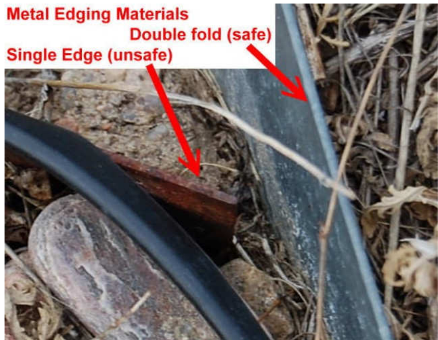
This photo shows two types of metal edging. The single edge type is not safe because it has a straight, sharp top edge that can cut your dog's feet. The double folded type is pet-safe because it removes the sharp edge.