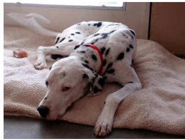
Dee Dee1 Fort Collins, CO