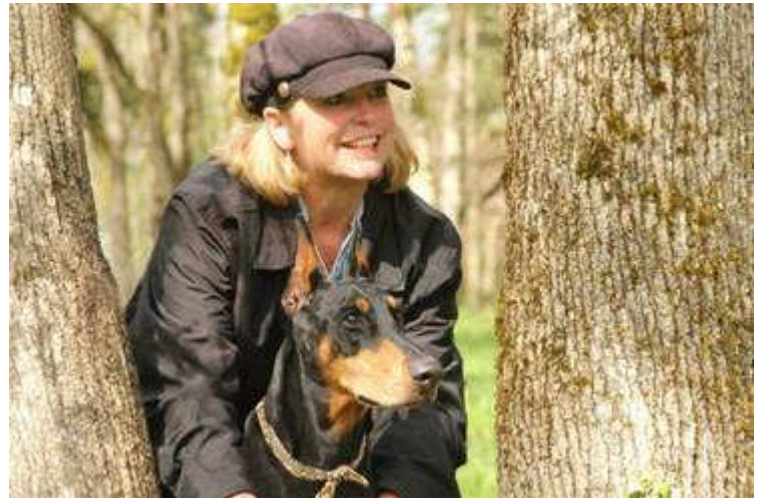
My Doberman, Jetta, and me