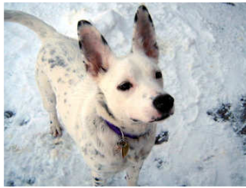
CJ Littleton, CO